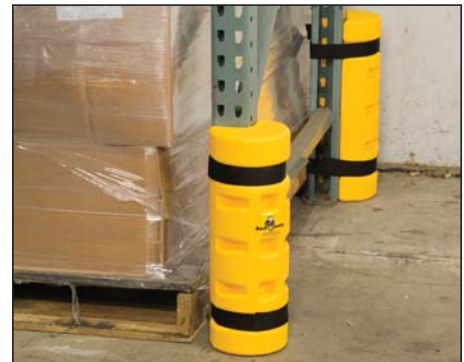
Corner units provide complete rack protection