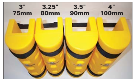
Available in widths to protect rack upright 3" to 4.75". 3" (75mm) is available with 6" cutout to accommodate horizontal beams