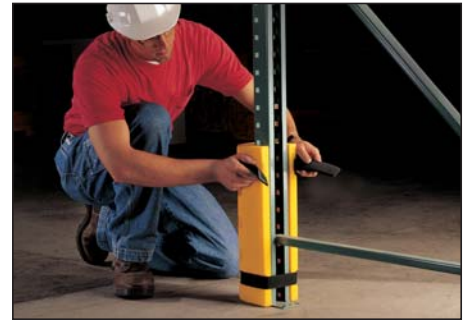
Easily installed by one person in seconds